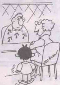
"He wants to know why you're still in your jim-jams in the middle of the afternoon!"